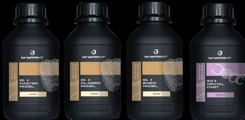
01 MASTER MODEL